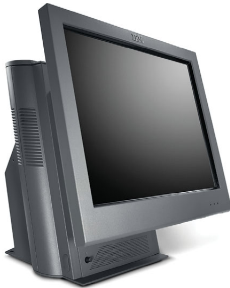
Shown: IBM SurePOS 500 Model 566