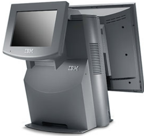
Shown: Independent customer display (6.5 VGA LCD) delivers customer information and digital, multi-media merchandising (optional)

IBM IR touchscreens are available as customer displays; and they are perceived as a service enhancement when used to engage shoppers with multimedia capabilities at the checkout counter.