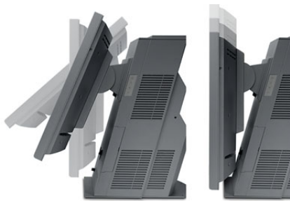
Shown: Infrared touchscreen never needs recalibration and provides a wide range of adjustment options for better viewing, including changing the angle/height of the display and adjusting the touch sensitivity, screen brightness and contrast ratio. (Model 566)

Each $1 in energy cost saved corresponds to a $6-$8 in overall operational savings. 5